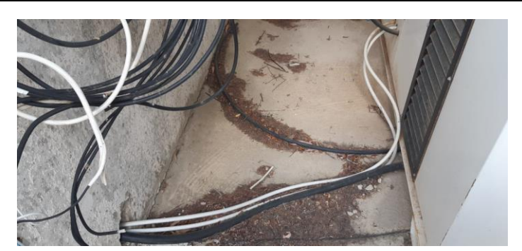
Cables should be arranged