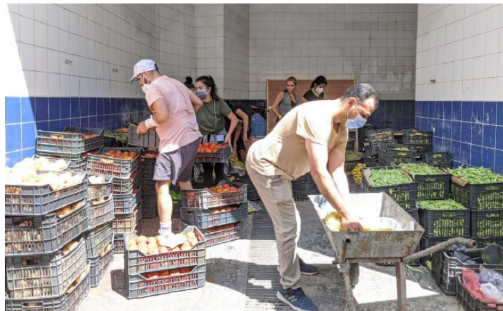
Volunteers from Nation Station are stocking vegetables received from an NGO, before distributing them to the community members in Geitawi (Beirut).