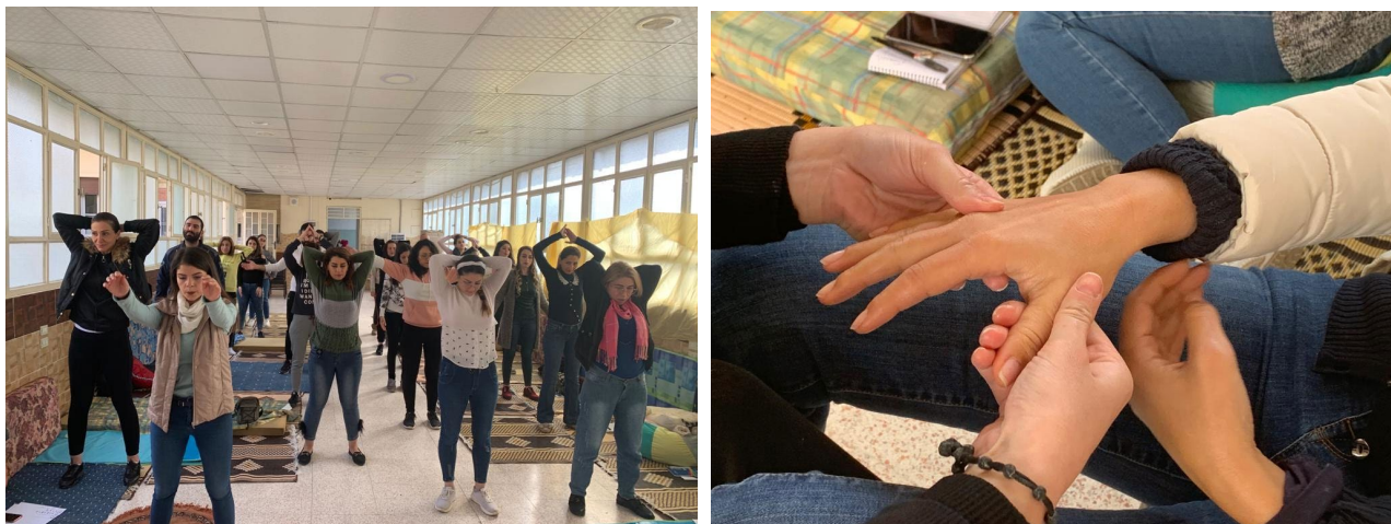
*Relaxation activities with the educators of the center Sénévé during the workshop (November, 2020).

With Sénévé, a center for children with specific needs in Homs (Syria), we implemented a 4 days' workshop led by a psychologist. As a result, 30 educators received support to manage stress and emotions and benefitted from individual and group therapy. This activity follows on from several workshops that were organized with the educators in 2017 and 2018. The team is fully dedicated to taking care of the 90 children and teenagers of the center, and they deserve as much support as possible to carry out their mission.