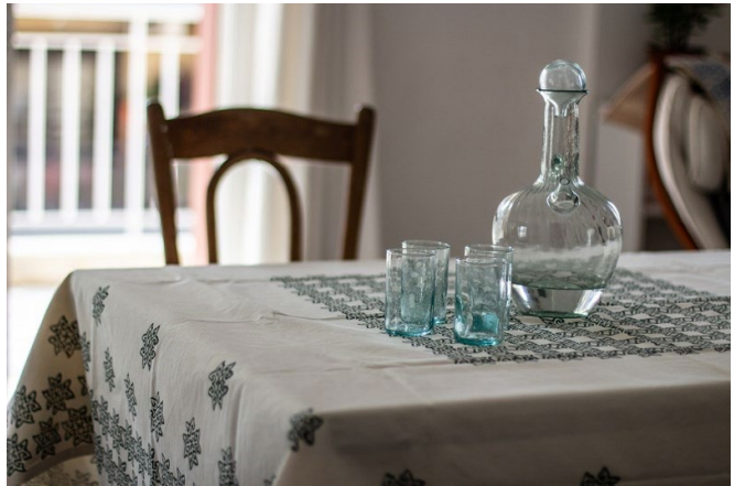
On the left, a photo of the sale organized in a coffee place in Ashrafieh (Beirut) in December 2020. On the right, a photo from the photo shoot organized in October 2020 to document their latest creations.