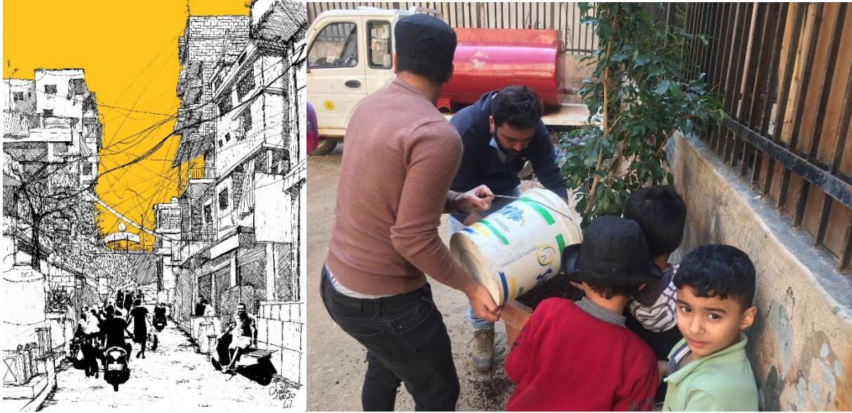
On the left, an illustration of the streets of Shatila, from Lilia Benbelaïd, Farasheh’s project leader. On the right, community members are planting a tree in the courtyard of the Children and Youth Center (CYC), in the frame of the Farasheh project and with the participation of Buzuruna Guzuruna.