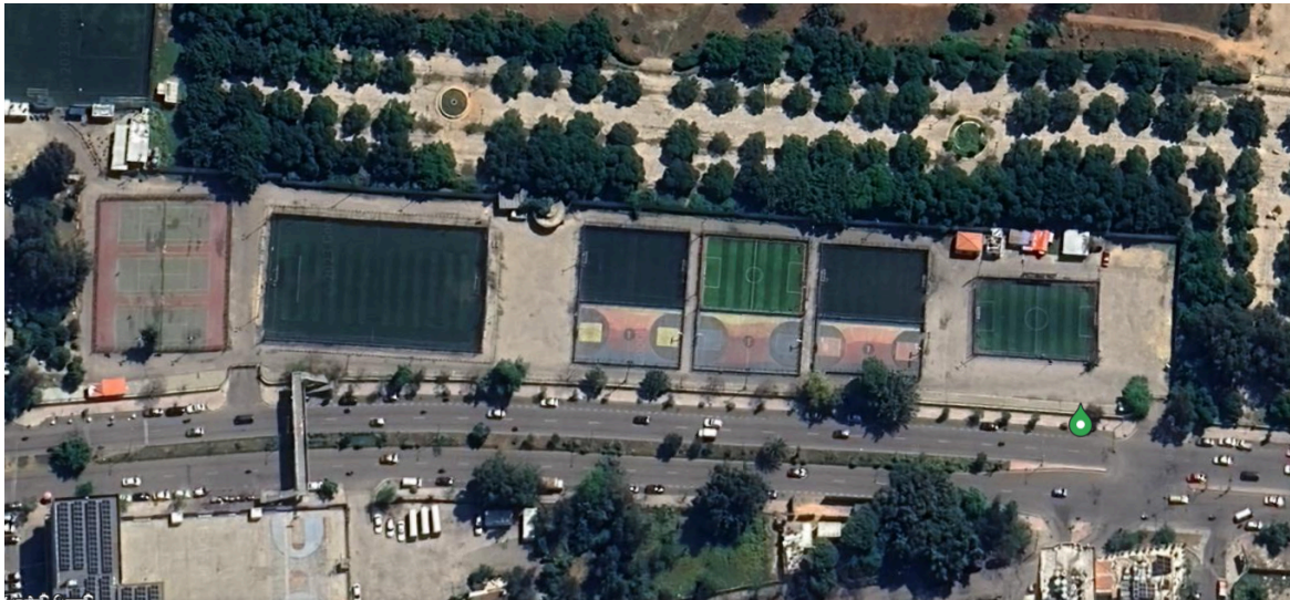
Figure 1: Aerial view of Qasqas Courts

The Qasqas Courts, nestled on the periphery of Horsh Beirut adjacent to Hamid Franjeh Street are a testament to community sports and recreational facilities in the heart of the city. Owned and managed by the Municipality of Beirut, this sports complex offers a variety of athletic facilities including three basketball courts, three tennis courts, five mini-football courts, and a football field.