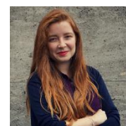
Article by: Denica Yotova