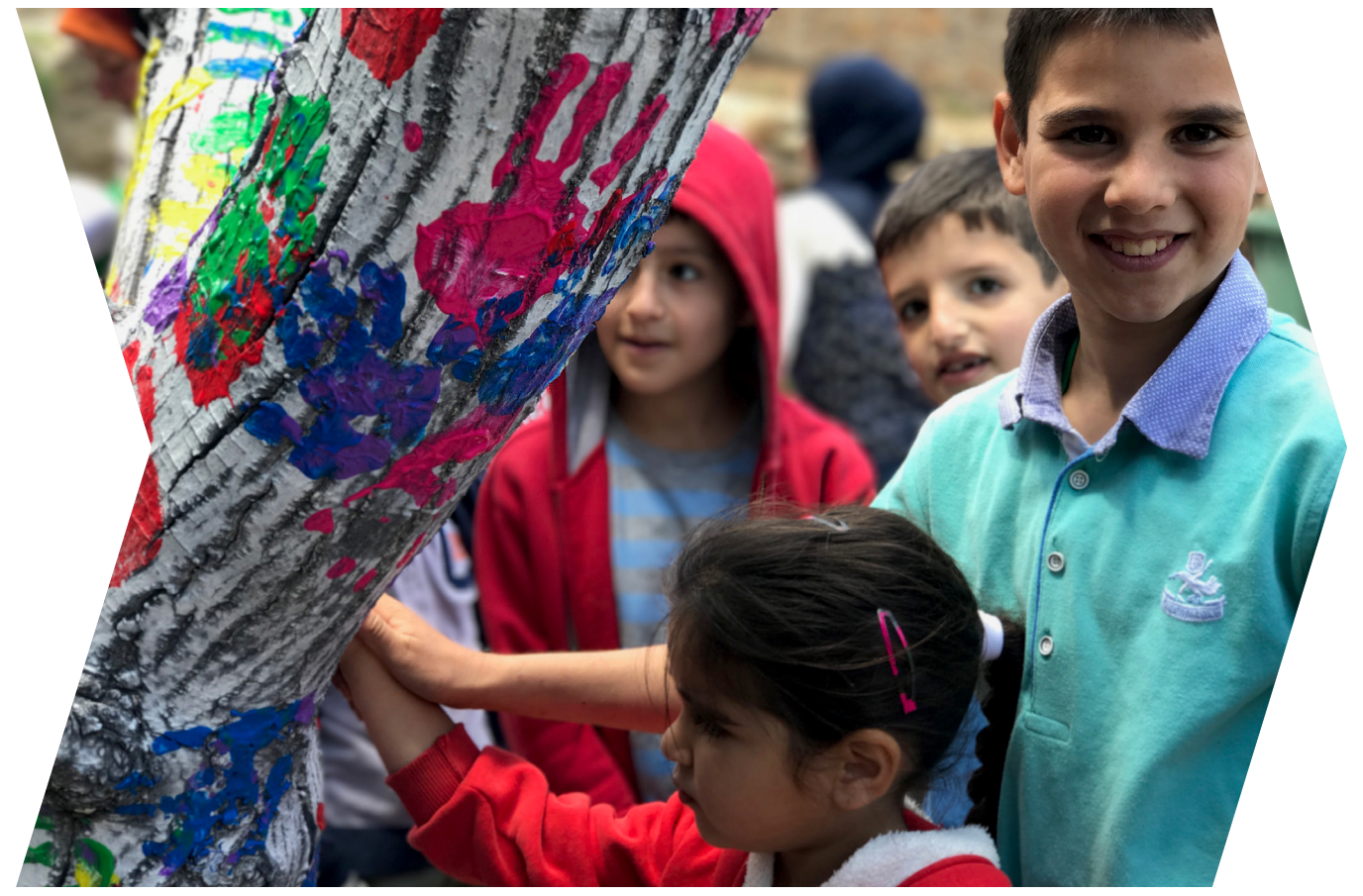
Elias Beam / Mercy Corps