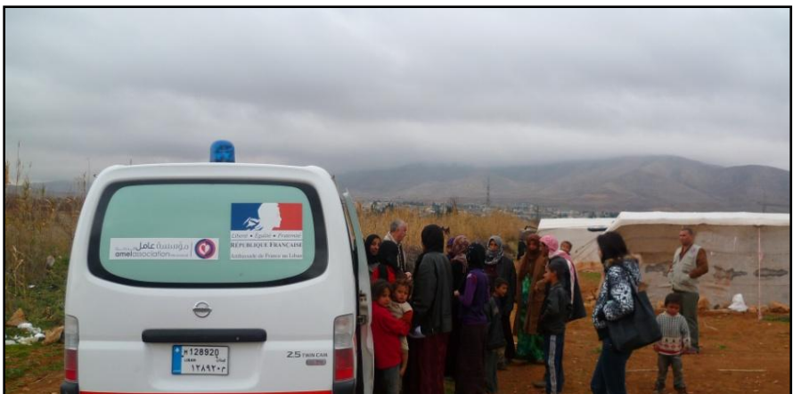
The mobile clinic in Northern Bekaa reaches Syrian refugees living in remote areas, El Ain, February 2013.

While winter was making life even more challenging for Syrian refugees, Amel has responded to their urgent needs by implementing distribution campaigns and through mobile clinics and active outreach by social workers. Although winter has ended now, refugees are in continuous need for NFIs, especially clothes and basic commodities, in order to ensure at least basic hygiene and to prevent the spreading of communicable diseases.