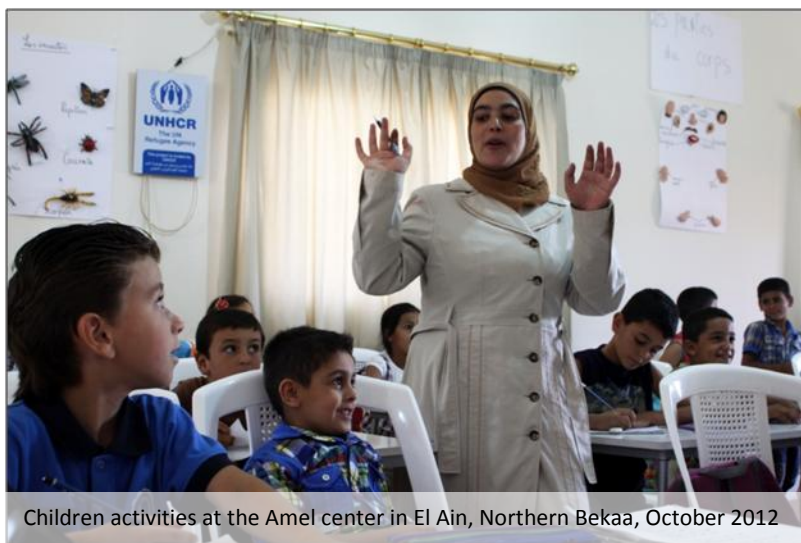
Children activities at the Amel center in El Ain, Northern Bekaa, October 2012

supported more than 1000 Syrian refugee children to adapt to the Lebanese curriculum by providing remedial support classes. Classes in English, Arabic, Mathematics and French are taking place three times a week in Amel's centers in the Bekaa Valley (Arsal, El Ain,