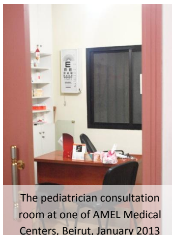
The pediatrician consultation room at one of AMEL Medical Centers, Beirut, January 2013

guarantee the quality of services provided. Social workers, with in depth knowledge about the targeted population, exclude vulnerable cases, mostly pregnant women and children under 5 from this fee. This symbolic payment for services has been greatly appreciated by the host population, by field workers and even among the refugee population, who are proudly demanding to receive quality for what they are paying. Income from the fees is covering additional running costs of implementing primary health services in the areas.