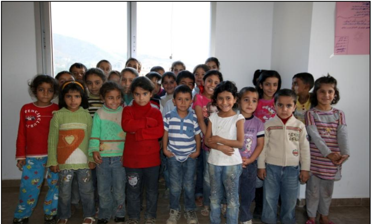
One of the classes at Kamed el Loz center in West-Bekaa, where the number of Syrian refugee children has rapidly increased, July 2012.

providing protection and assistance to Syrian refugees who have sought safety in Lebanon from violence and deplorable humanitarian conditions in Syria. However, they now face a challenging