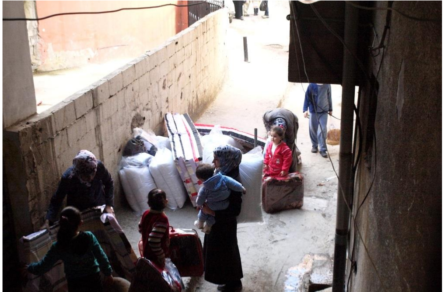
Distribution of bedsets to Syrian refugee families at AMEL center in Hay es Sellom, South Beirut, February 2013.

With the increased needs of Syrian refugees Lebanon as they stay longer in Lebanon on the one hand and new