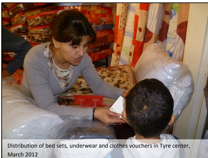
Distribution of bed sets, underwear and clothes vouchers in Tyre center, March 2012

Syrian refugees experience great difficulties finding shelter and places to live. Aid workers have warned for months that housing levels for refugees are quickly reaching a saturation point. Amel social workers in the field have reported increasing rent prices everywhere across the country. Syrian families are forced to pay exorbitant rates, over approximately