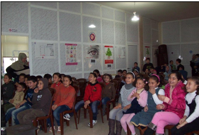
Syrian children enjoying a puppet show at AMEL center in Khiyam, South Lebanon, December 2012.

team of social workers and animators on location. Within urban settings, mainly in Beirut, Amel plans to visit Palestinian camps to conduct specific activities on child protection, such as recreational activities, psycho social support and referral for specialized services. Many refugees from Syria, both Palestinian and Syrian, have moved to Palestinian camps in Lebanon, where currently services provided by UNWRA are insufficiently covering the rising needs. Through mobile teams and community events, in close coordination with Palestinian partners within the camps, Amel will be able to respond to the increasing demands for child protection services.