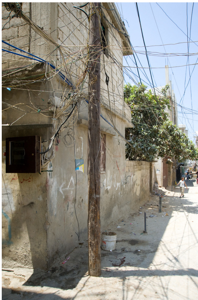
These narrow mazes of paths and low hanging wires overhead in Ein El Helweh are ubiquitous to every camp in Lebanon.