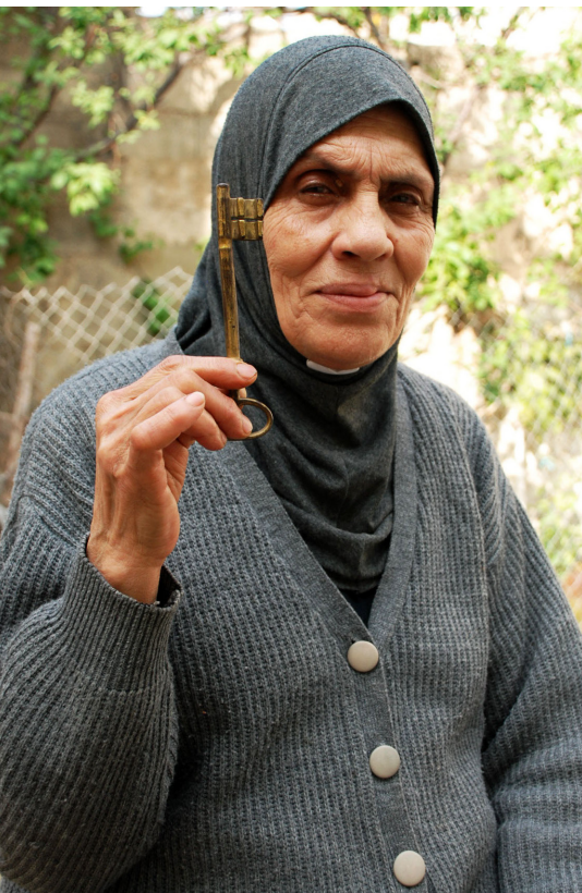
This resident of Beddawi, like so many refugees, has kept the key to her family's home in Palestine, which she left in 1948.

12 Dbayeh: Home to about 4,000 refugees, most of them Christian Palestinians who arrived in the mid-1950s from the Galilee. UNWRA estimates that one in four structures were damaged or destroyed in 1990 as a result of Lebanon's civil war.